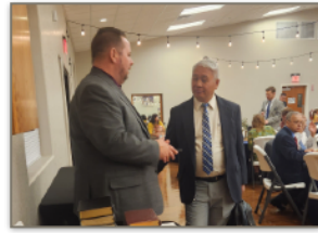
Presenting across the country