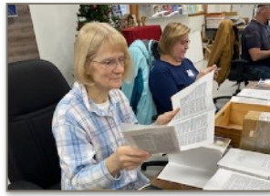
Blessing the Lord by assembling His word