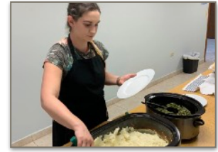
Serving the pastors In Puerto Rico