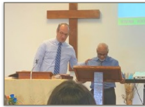
Preparing for Puerto Rico trips