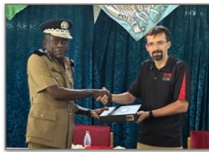
Begging for Bibles in Malawi