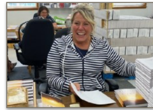
Serving by love In the print shop