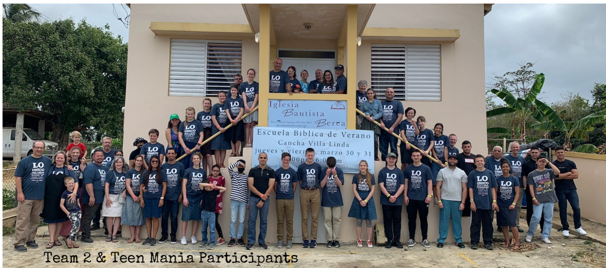
Team 2 & Teen Mania Participants